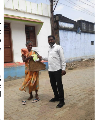
Scripture being distributed into the hands of people in India.