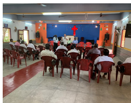
Training national pastors in New Testament Church Planting.