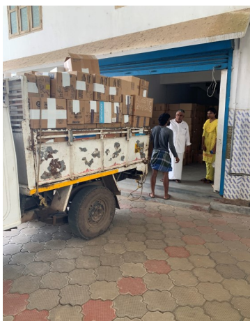
Loading Tamil John and Romans for a national pastor.