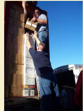
PACKING THE CONTAINER FULL FOR INDIA.

We Praise the Lord for the safety as we traveled from Missouri to Texas and on to Iowa the last few weeks. We are very thankful for the new supporting church in Texas and gladly welcome their involvement in the ministry. It is a great joy to see how God provides for us in His ministry.